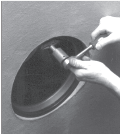
Install Kor-N-Seal I - Wedge Korbond with Socket Wrench & Torque Limiter