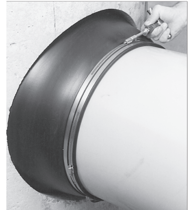
Install Pipe Clamp(s) with T-Handle Torque Wrench